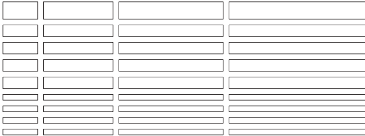
40-40-20 CUTTING MAP 5 UNITS OF STONE PLANKING™ SHOWN

40-40-20 is created by taking your order of Stone Planking™ and cutting 40% at 4" wide, 40% at 2" wide, and leaving 20% at 6" wide.